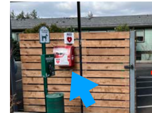
The Oaks Carport