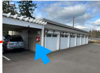
Carport 29 Next to Garage 90